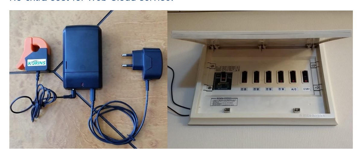
(75A Clamp, WIFI transmitter, 220V Power Adapter) (Indoor switching box)

Plug and play type. No extra cost for Web Cloud service.