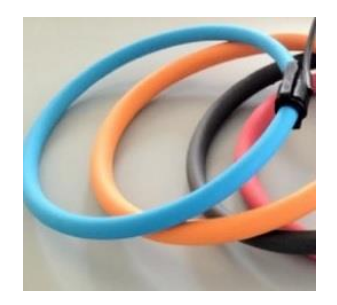
(500A, Transmitter, Battery Pack, 200A, 350A)