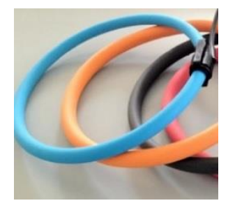
(500A, Transmitter, Battery Pack, 200A, 350A)

Model: SEM3500A (Optical Sensor Watt meter)